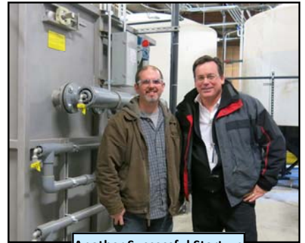
Another Successful Start-up

Upon start-up the new wastewater recycle and pretreatment system produced the desired results. The dual lift stations and equalization tanks captured process line discharges. The pH tank effectively conditioned the water for downstream polymer application. The PEWE DAF, a HD²XLRator™ LS-50 model, easily removed suspended solids while the triple multimedia filters polished the discharge. Solids were squeezed in the DeWater Systems belt filter press.