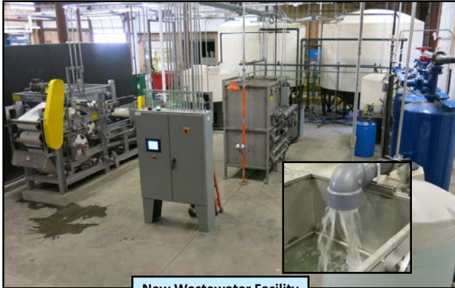
New Wastewater Facility